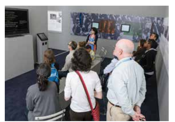
LEAGUE OF NATIONS MUSEUM