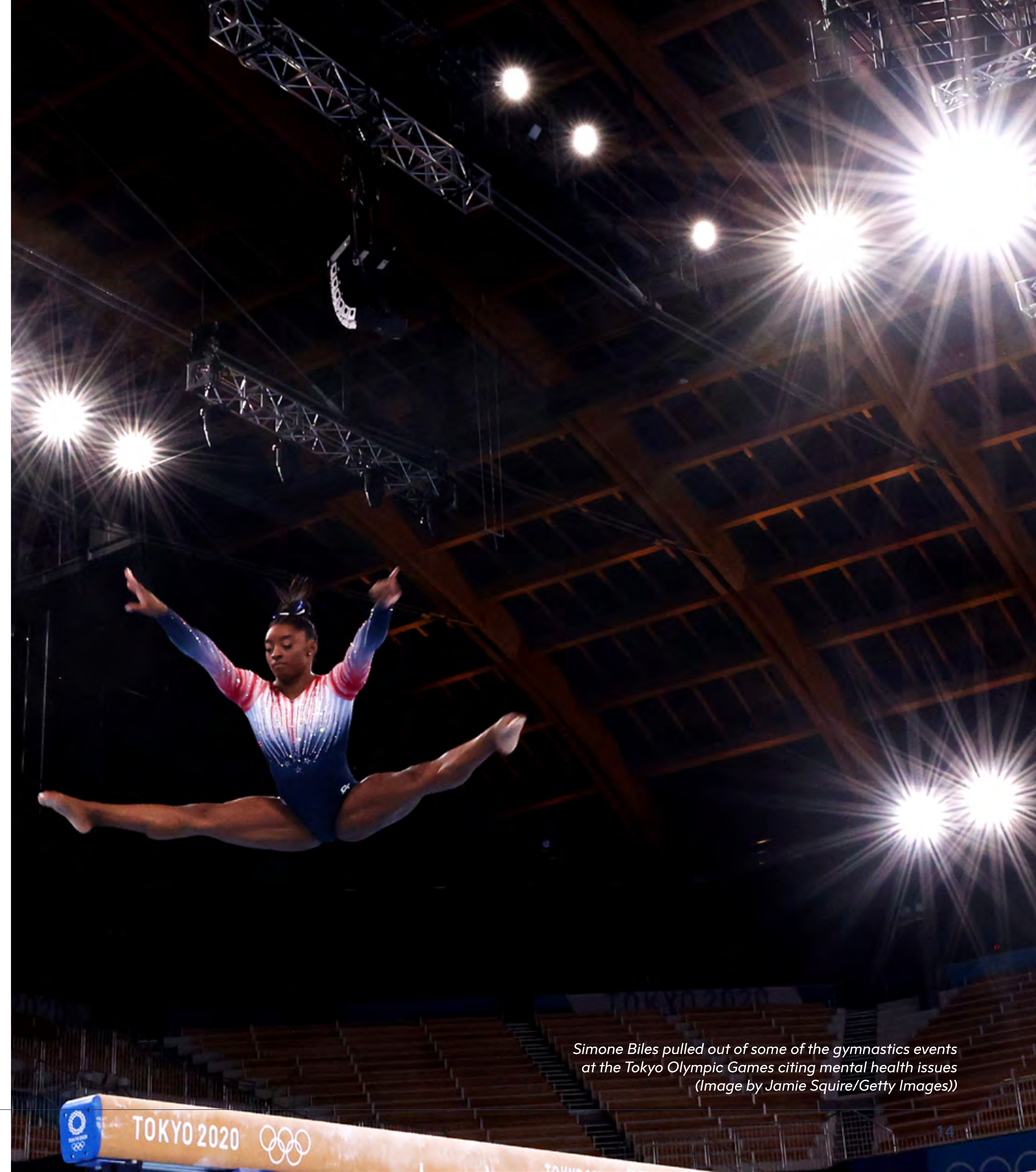
Simone Biles pulled out of some of the gymnastics events at the Tokyo Olympic Games citing mental health issues

The Australian Open controversy over Novak Djokovic and his deportation from Australia raises questions over whether athletes should be offered exemptions to travel when much of the world continues to face quarantines and other constraints, and are a reminder of the ongoing challenge of coordinating rules around events with host government regulations. Vaccination requirements and exemptions for sporting events in 2022 highlight wider health inequalities in society and will likely to continue be scrutinised.