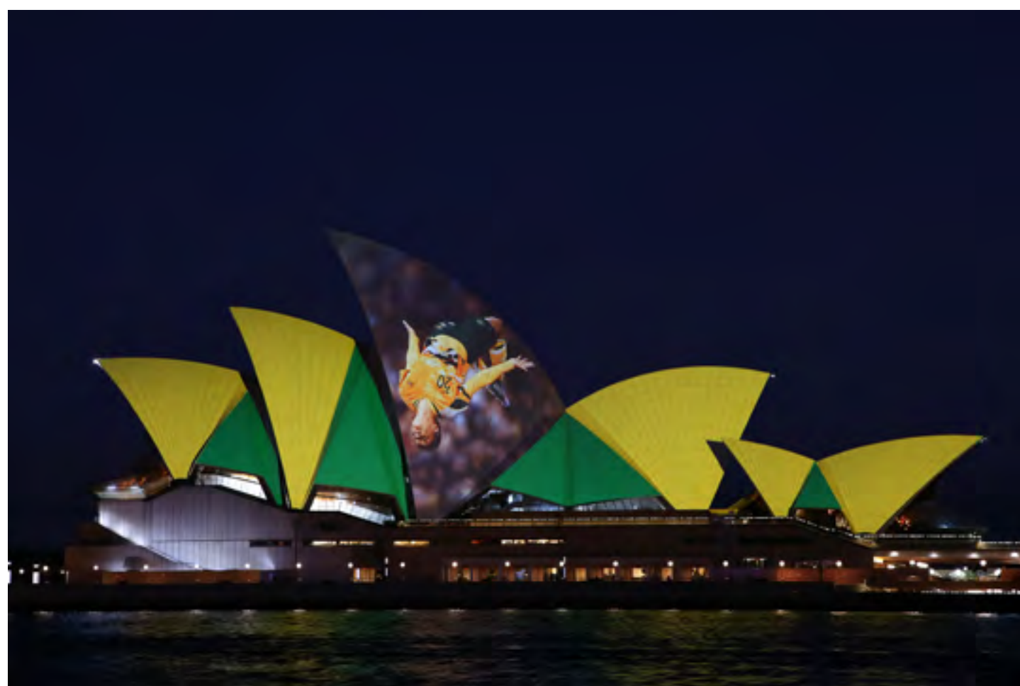
The 2023 FIFA Women's World Cup will be hosted by Australia and New Zealand

ecosystem, in providing technical assistance to the Organising Committee for the FIFA Women's World Cup 2023 Australia & New Zealand.