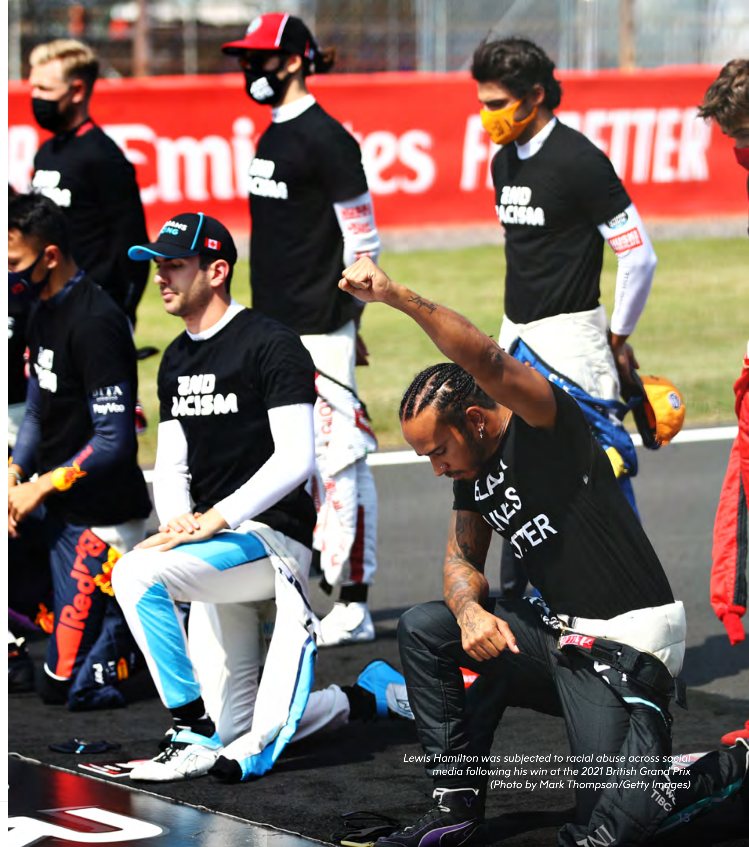
Lewis Hamilton was subjected to racial abuse across social media following his win at the 2021 British Grand Prix

In reality, such progress is still sporadic and limited, and much more needs to be done. The challenges of lack of representation and equal access are endemic for a variety of social reasons, cultural norms, patriarchal constructs and the legacies of historical injustices and colonialism. In 2022, the sports ecosystem will see renewed calls and campaigns to bolster existing initiatives to transparently address these issues and for new strategies that take a zero tolerance approach to racism and social injustice. If sport and its corporate and broadcast partners can fulfil their responsibilities, be proactive about their duty of care, and be more inclusive, accessible and welcoming, then the foundations can be laid for transformational leadership with real impact for people and communities.