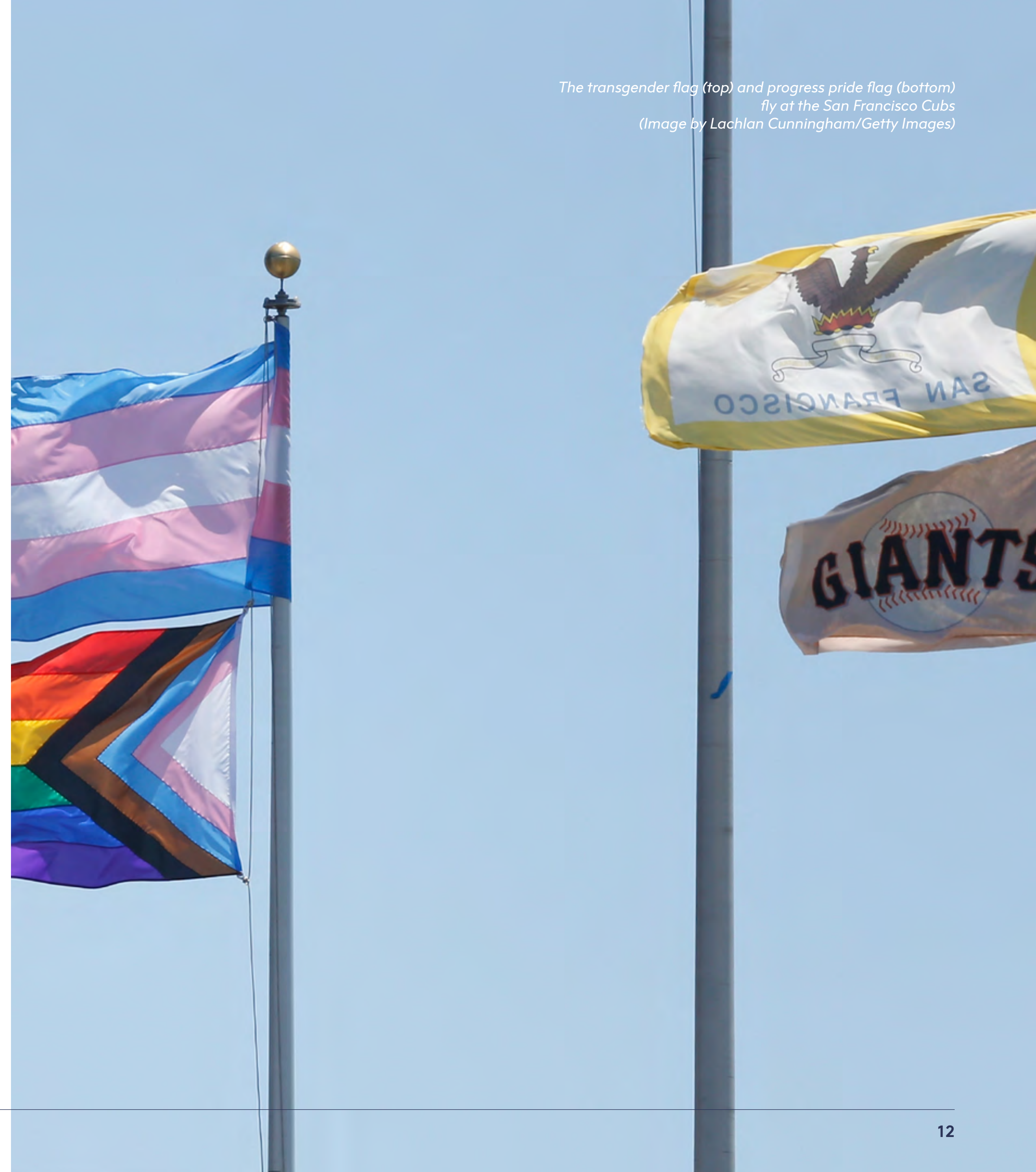
The transgender flag (top) and progress pride flag (bottom) fly at the San Francisco Cubs

2022 will also likely see a significant increase in research conducted in this emerging area, as one of the key recommendations of the IOC framework is that diverse gender identities and variations in sex characteristics should not be assumed as an unquestionable sign of disproportionate advantage nor imply unavoidable risk to other athletes. Rather, any eligibility rules should be based on ethical, credible, and peer-reviewed research. Keeping human rights approaches at the centre of these developments will be critical in ensuring positive outcomes for all involved.