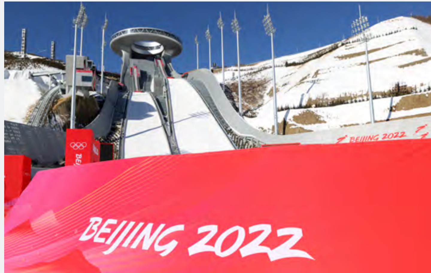
The 2022 Beijing Winter Olympic Games kicks off on the 4 February 2022

able to operate in accordance with international standards and best practice.