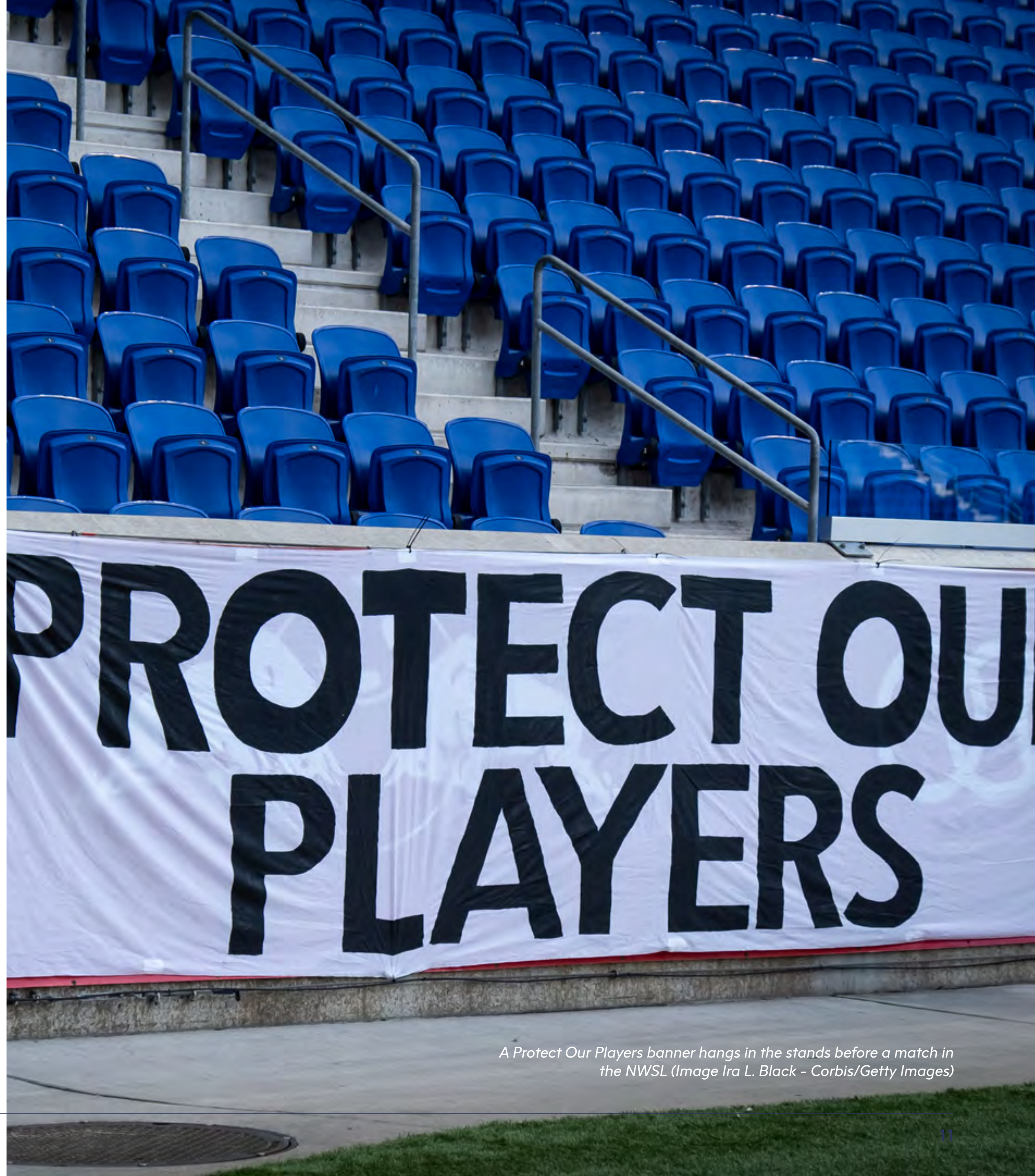
A Protect Our Players banner hangs in the stands before a match in the NWSL

The year ahead will see continued efforts by a range of actors to develop practical tools, guidance and materials to support sports leaders in the work they must do to adopt human rights commitments, undertake due diligence, and implement robust policy, evaluation and measurement frameworks. For those willing to step up, the roadmaps and support increasingly exist to make a positive difference and strengthen the entire sports ecosystem.