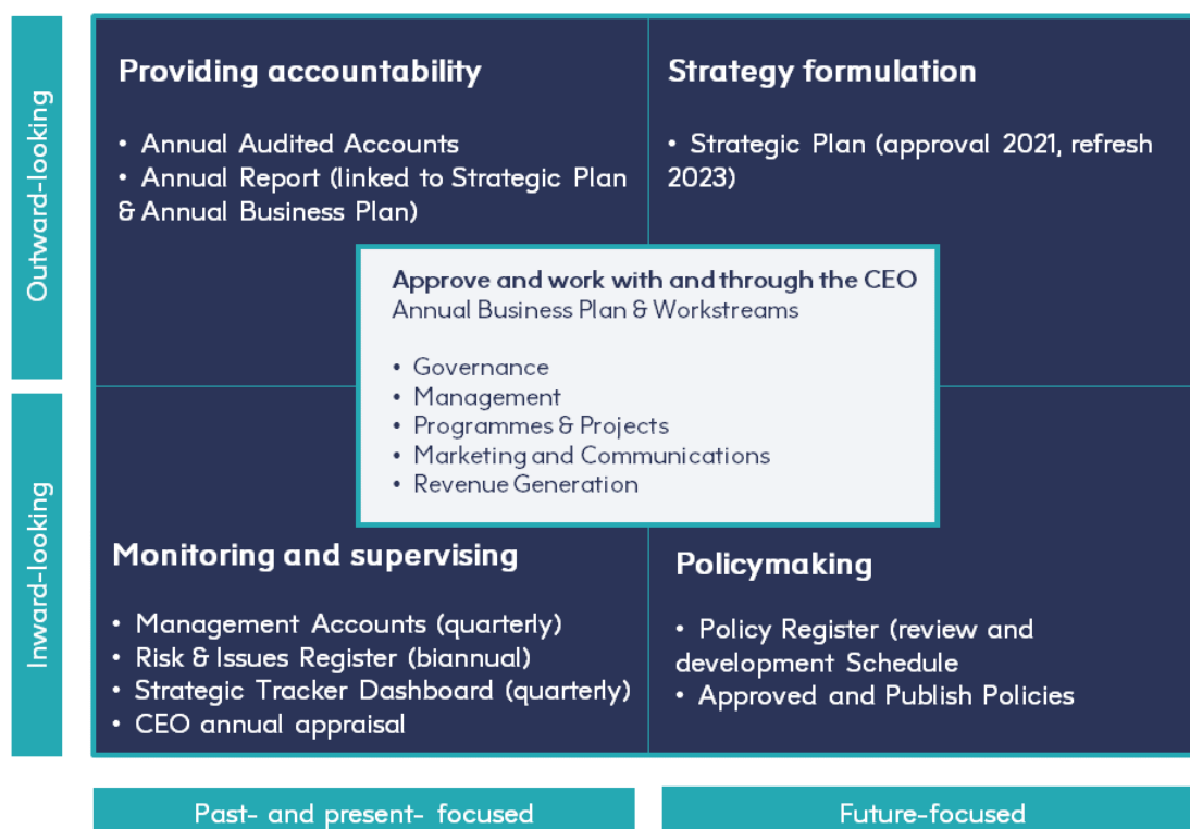
Figure 4: Board Functions Working Through Management

The Directors are responsible first and foremost to the Centre itself and must always act in its best interests and in accordance with its Articles. The partnership between the Board and the executive leadership of the Centre's management team depends on a clear and shared understanding of how their roles and spheres of responsibility relate to each other.