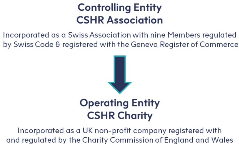
Figure 1 : Structure of the Centre

The Centre for Sport and Human Rights refers to two entities - the parent or controlling entity incorporated in Switzerland and the operating entity incorporated in the United Kingdom. The Directors serve on the boards of both entities.